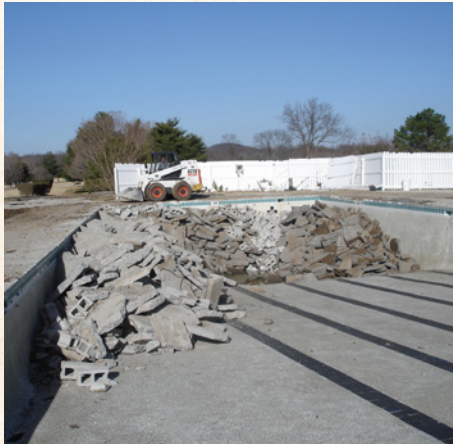
Former swimming pool at the Country Club of Franklin (City of Franklin Parks Department)