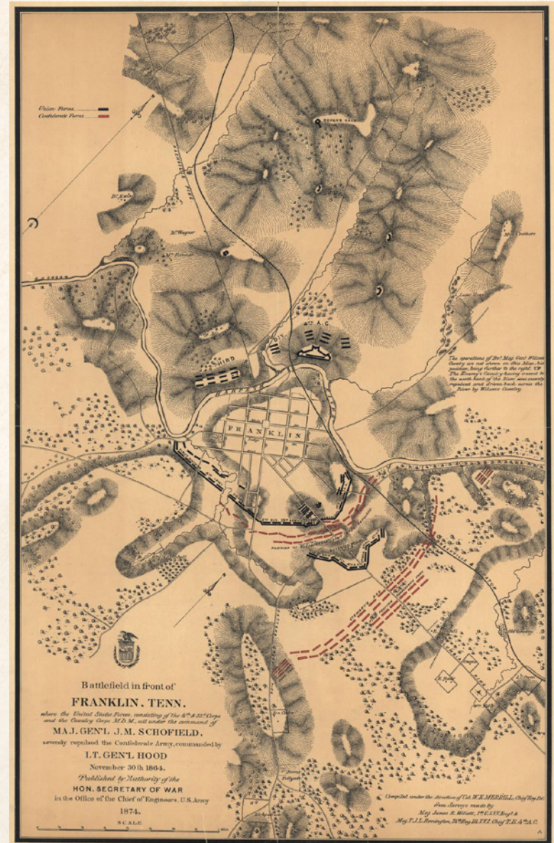
Battlefield in front of Franklin, Tennessee, 1874