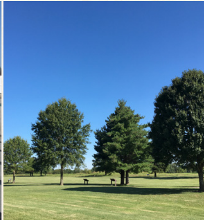
Eastern Flank Battlefield Park (Tennessee Civil War National Heritage Area)