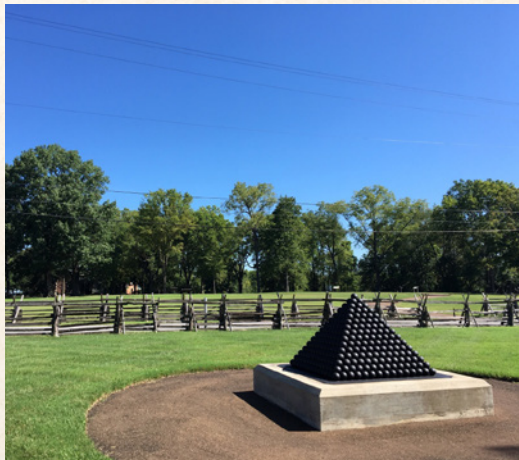
Cotton Gin Park (Tennessee Civil War National Heritage Area)