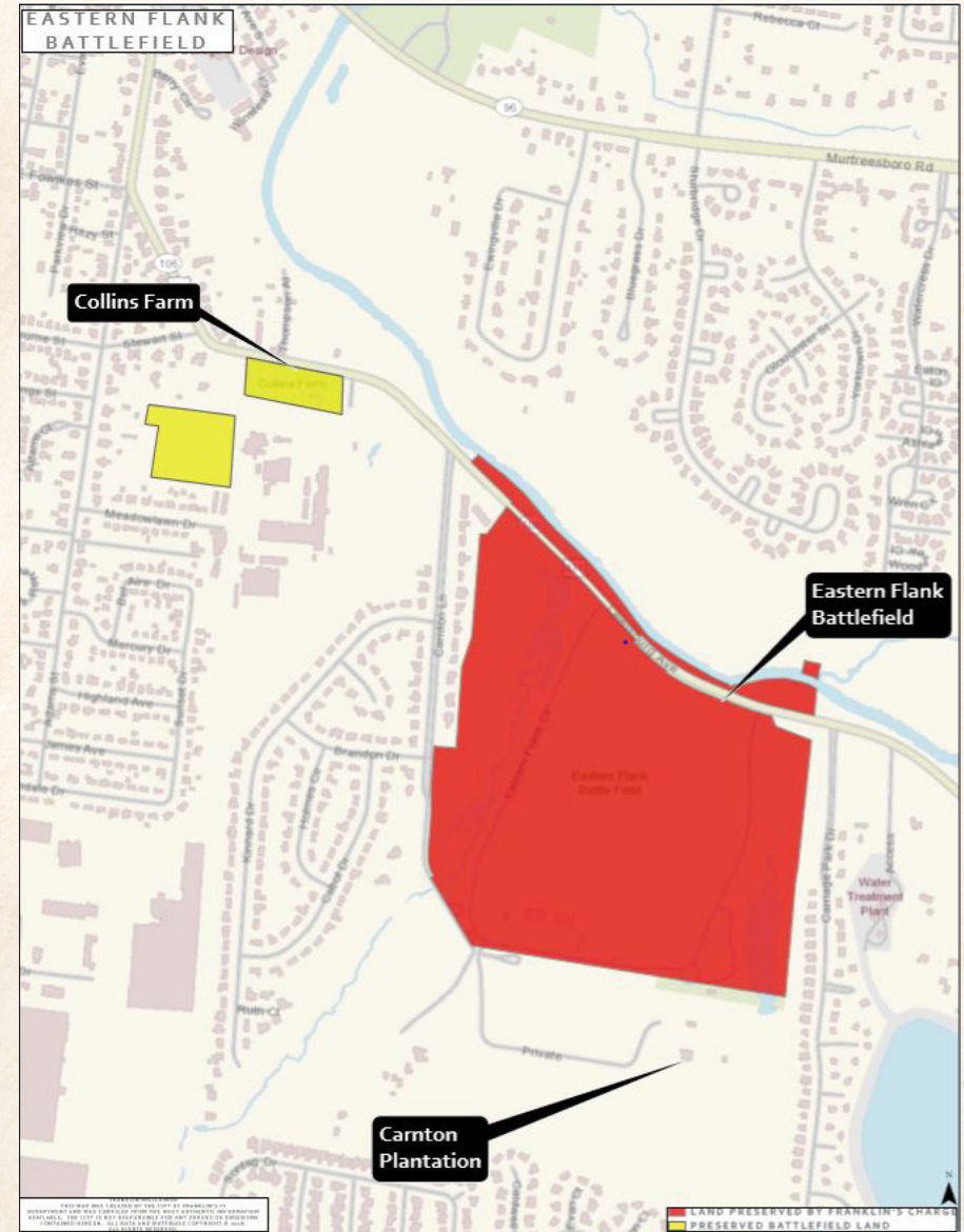
Eastern Flank Battlefield Park