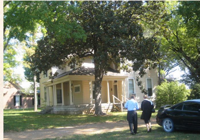
Holt House (Tennessee Civil War National Heritage Area)