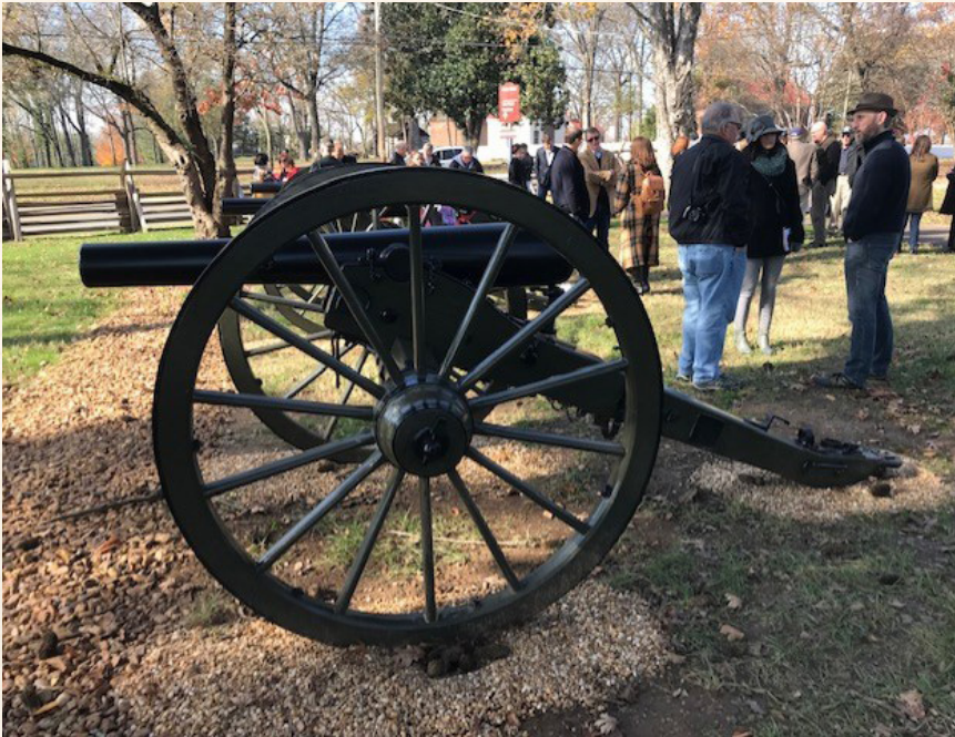
Cannons installed at Carter Hill Battlefield Park in 2017