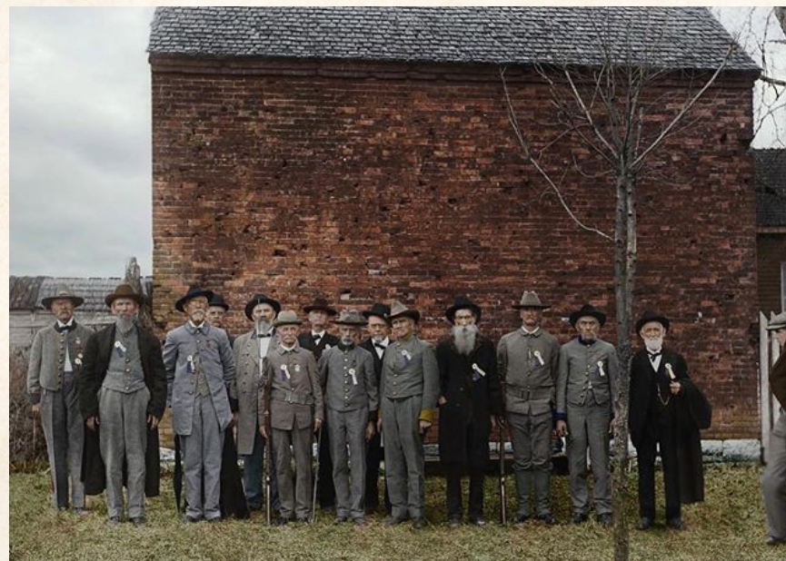
Union and Confederate veterans pose in front of the bullet-riddled Carter smokehouse during the battle's 50 th anniversary reunion in 1914.

When the 125th anniversary of the battle came in 1989, those disjointed parcels were all Franklin had of the battlefield. So much had been seemingly lost forever. Several houses, a pizza joint, and a small shopping center covered the point of heaviest fighting at Carter Hill. Concerned citizens formed Save the Franklin Battlefield, Inc., to interject new hope for battlefield preservation, and by 1992 the group had saved its first parcel—a lunette, part of Fort Granger—at the junction of Mack Hatcher Parkway and Liberty Pike. That year also began a series of local conferences on battlefield preservation, which started to attract greater interest from local government and nonprofits.