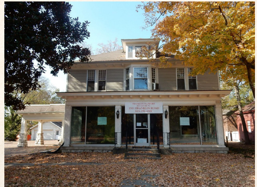
Franklin Flower and Gift Shop (Tennessee Civil War National Heritage Area)