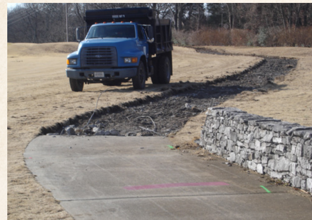
Cart path removal at the Country Club of Franklin (City of Franklin Parks Department)