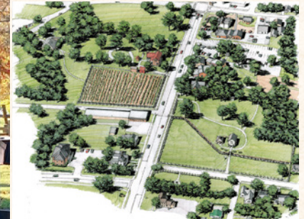
Right: Ben Johnson's rendering of Carter Hill Battlefield Park (Battle of Franklin Trust)

Boundaries for the park continued to expand with strategic acquisitions. A $637,500 grant from the American Battlefield Protection Program and a $630,000 grant from the Tennessee Civil War Sites Preservation Fund, administered by the Tennessee Historical Commission, fueled the January 2018 purchase of the Spivey Tract at 1214 Columbia Avenue by Franklin's Charge and the Battle of Franklin Trust. To complete the $1.365 million purchase price, Franklin's Charge raised over $69,000, matched in part with $56,250 from the American Battlefield Trust (the former Civil War Trust).