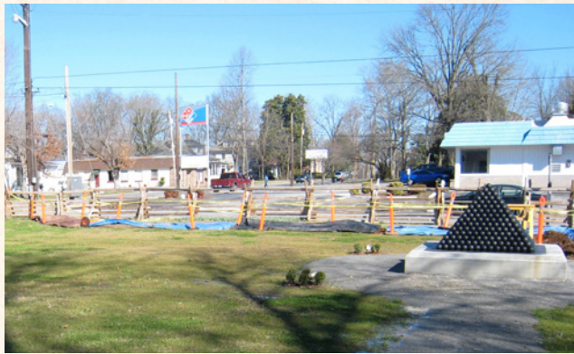
Carter Hill Battlefield Park before the removal of Domino's and other buildings