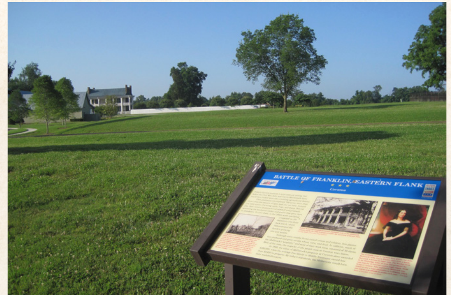
Markers at the Eastern Flank Battlefield Park (Tennessee Civil War National Heritage Area)