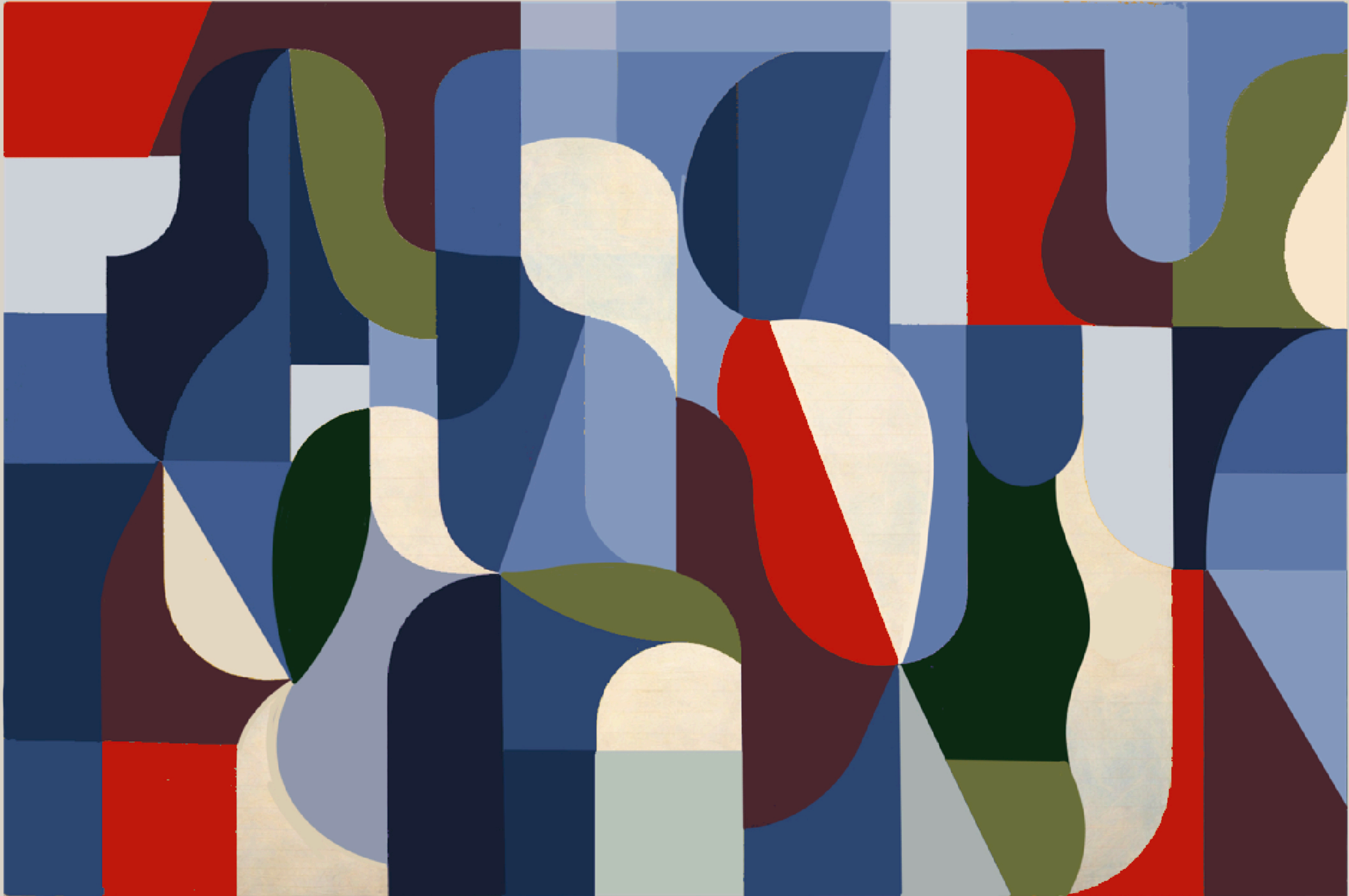
Mural Location 3