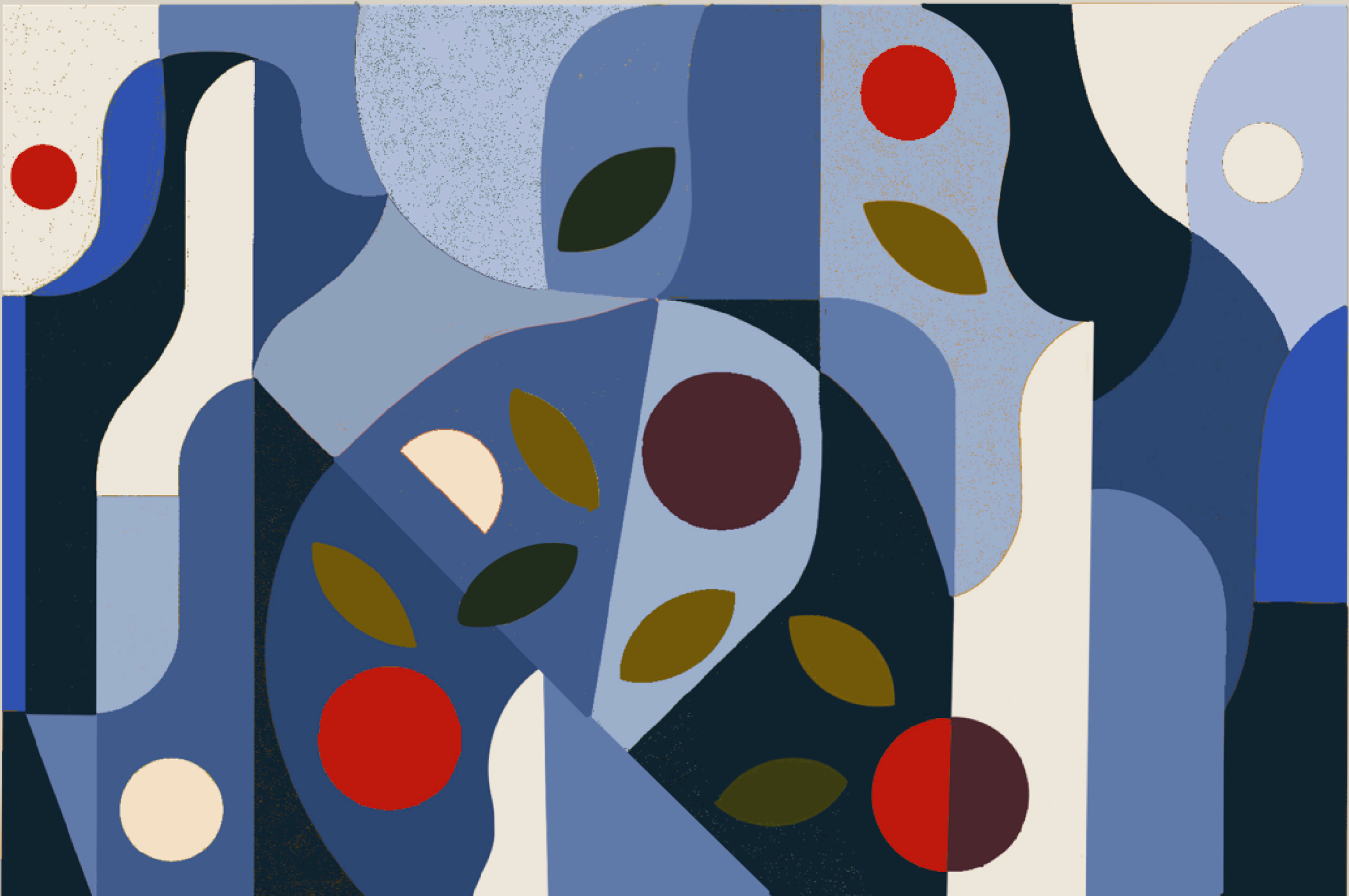
Mural Location 2