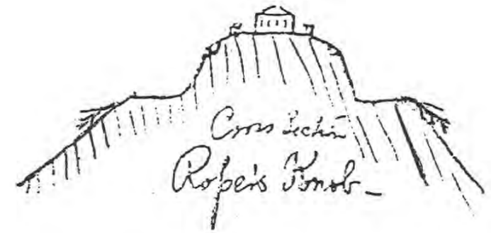
Figure 3. Sketch of Roper's Knob by William Merrill (1863).